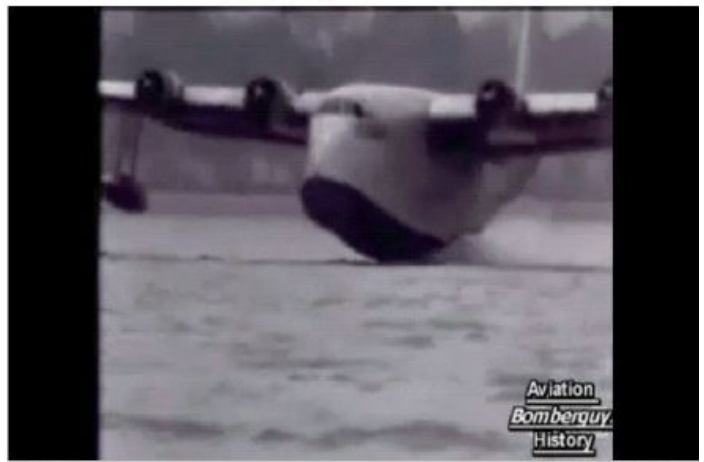
Short S23 C Class Empire Flying Boats Part 1

http://www.youtube.com/watch?v=zqOSQ5qSHXl&NR=1&feature=fvwp