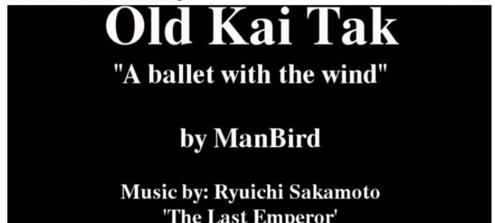
Kai Tak Extreme Landings

Here it is in a spectacular modern simulation.