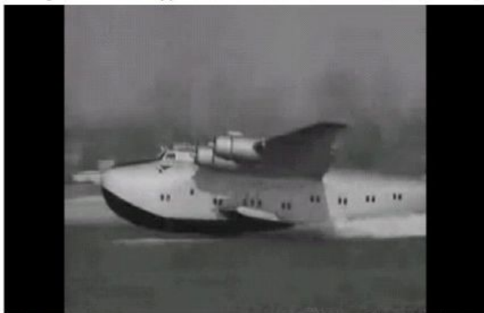
Boeing 314 Yankee Clipper NC18603

http://www.youtube.com/watch?v=pRYzFjift2Q&feature=related