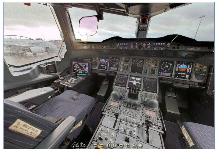
Airbus A380 Panoramic Cockpit